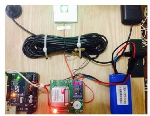
Fig. 3: Experimental Setup of Proposed System

Heart rate sensor detects the heart rate by taking the normal of readings by altering most extreme and least values (ordinary scope of heart beat is 60-100bpm) and the information is exchanged to MCU.